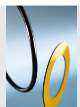
APSOseal® Sealing Technology